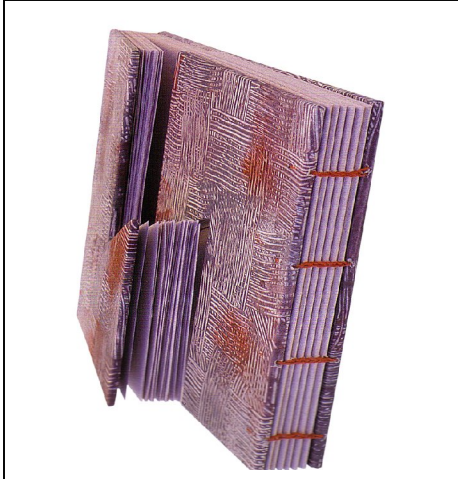
Ingrid Hein Borch, Untitled 2006 Book board, paste paper, dyed linen thread, acid-free text paper: Coptic binding

Presented by the East Gippsland Art Gallery